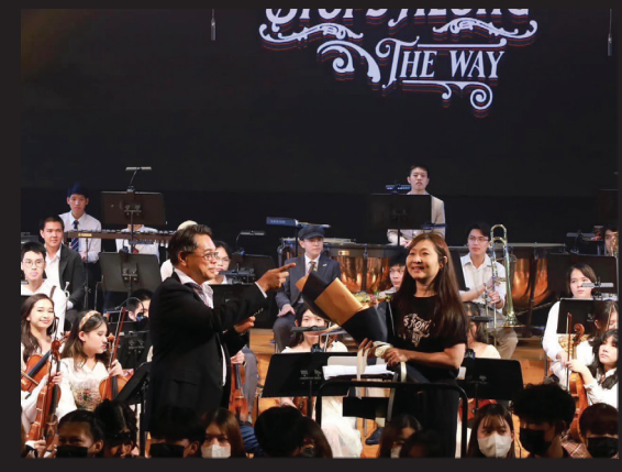
Highlight photos of PC YAMP Concert Series "STOPS ALONG THE WAY"

Thank you for all your support, see you next year with new chapter of PC YAMP CONCERT SERIES!