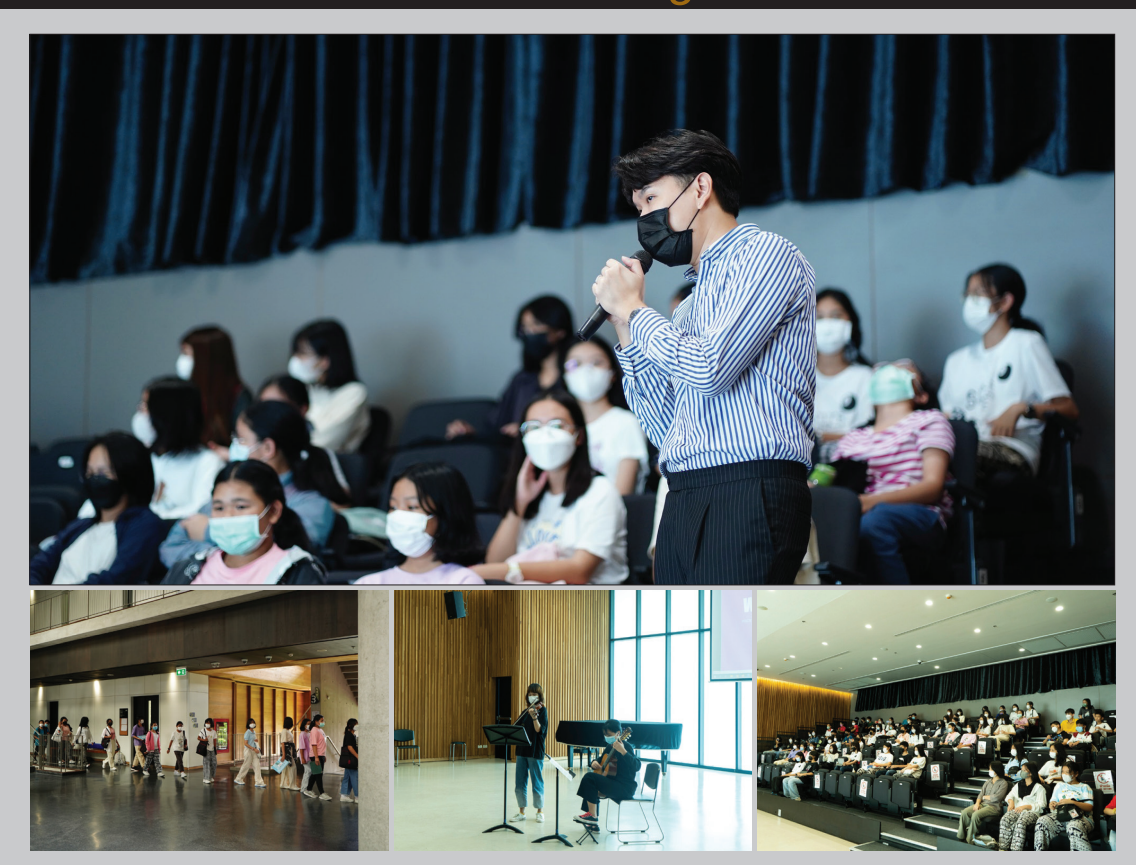
On September 15, 2022 - The College of Music, Mahidol University welcomes students from the Sirindhorn School, Surin to visit Young Artist Music Program (YAMP) Pre-College for the school tour, program guidance and see students' music performances.