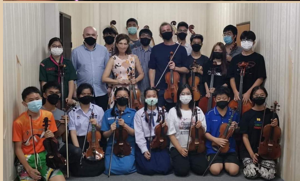
Faculty Highlight - On May 24-25, 2022 - Libere String Quartet consisting of faculty from the String and Chamber Music Department performed at Heritage Chiang-rai and held a masterclass for the Chiangrai Youth Orchestra.

centralwOrld joins forces with global partners and highlights itself as 'genderless' company by joining hands with United Nations Development Program (UNDP), Tinder, Miss International Queen 2022 pageant, Muse by Metinee and Mahidol Wind Orchestra' (MWO) College of Music, Mahidol University to create sensational event through centralwOrld 'Free to be' campaign - Free to be yourself in your own way to promote equality, gender diversity (LGBTQIA+) and acceptance of everyone's true identity during "Pride Month" of June.